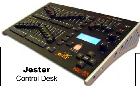
Jester Control Desk