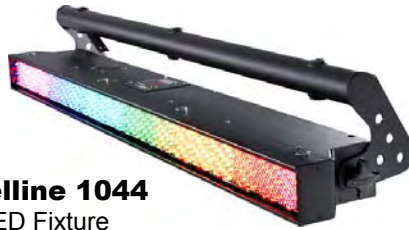
Pixelline 1044 LED Fixture