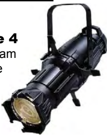
Source 4 Fixed Beam Profile