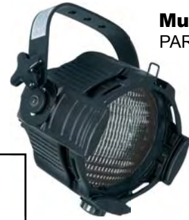
Multipar PAR Lamp