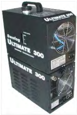
Ultimate 300 Hazer