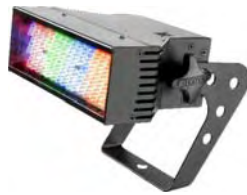
Pixelline Micro E LED Fixture