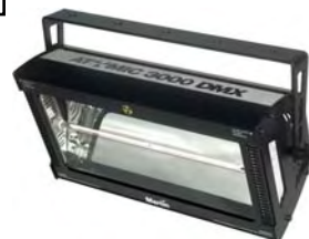
Atomic 3000 Strobe