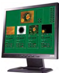
Hippotizer Digital Media Server