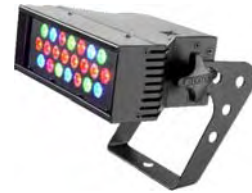
Pixelline Micro W LED Fixture