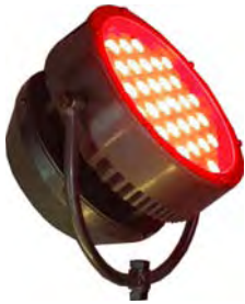
Pixelpar 90 LED Fixture