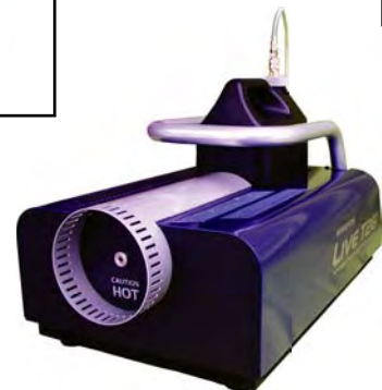
Live T26 Smoke Machine