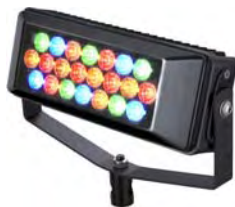
Pixelbrick 22 LED Fixture